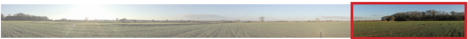
Viewpoint location and extent of view.

Viewpoint 7 - Existing Winter View View from Higher Ground South-east of Easton Maudit